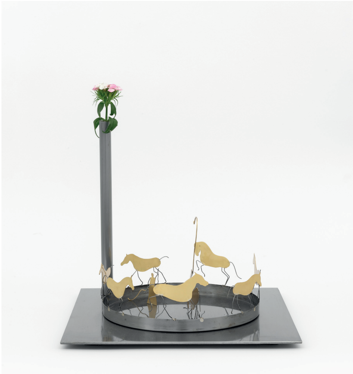
Piazzette n. 5 , 2023 alluminio rame aluminium, copper 31,5 x 35 x 35 cm