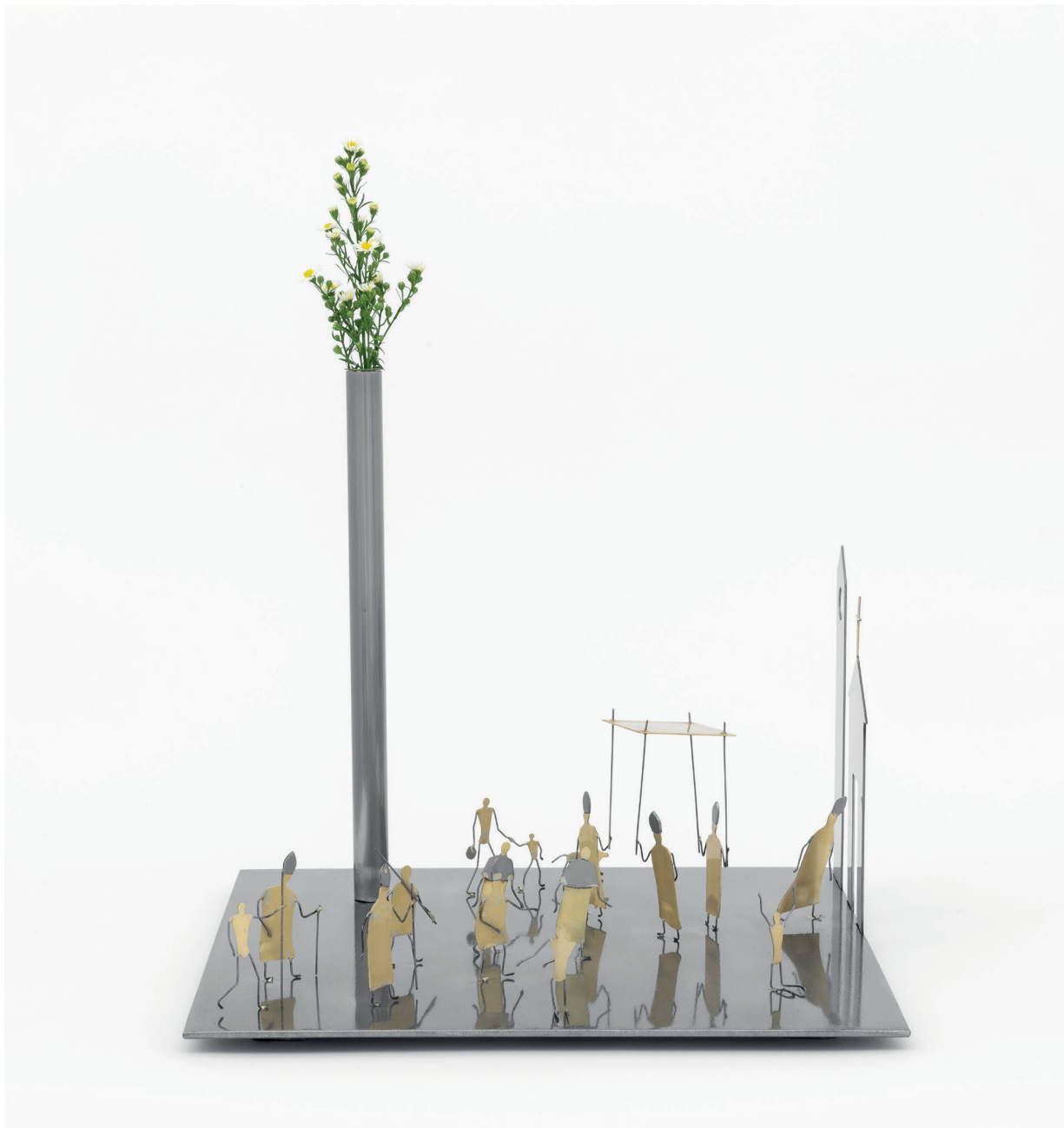
Piazze n. 3 , 2023 alluminio, rame aluminium, copper 31,5 x 35 x 35 cm