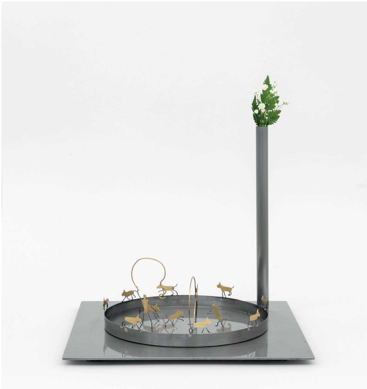
Piaze n. 8 , 2023 alluminio rame aluminium, copper 31,5 x 35 x 35 cm