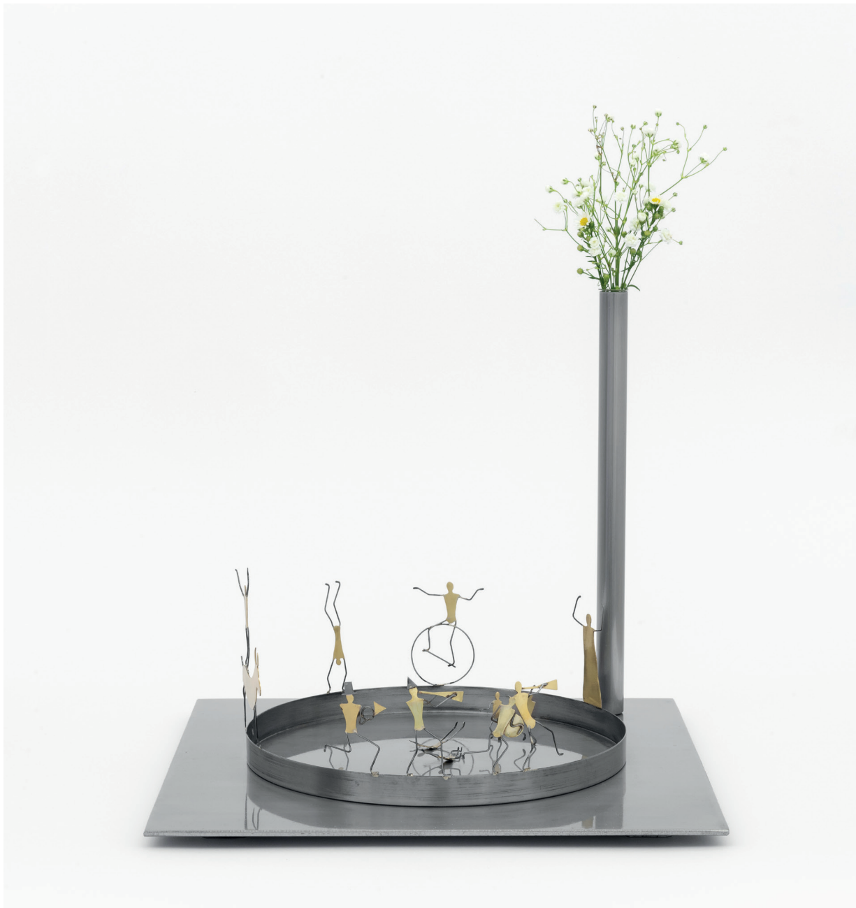
Piazze n. 2 , 2023 alluminio rame aluminium, copper 32 x 35 x 35 cm