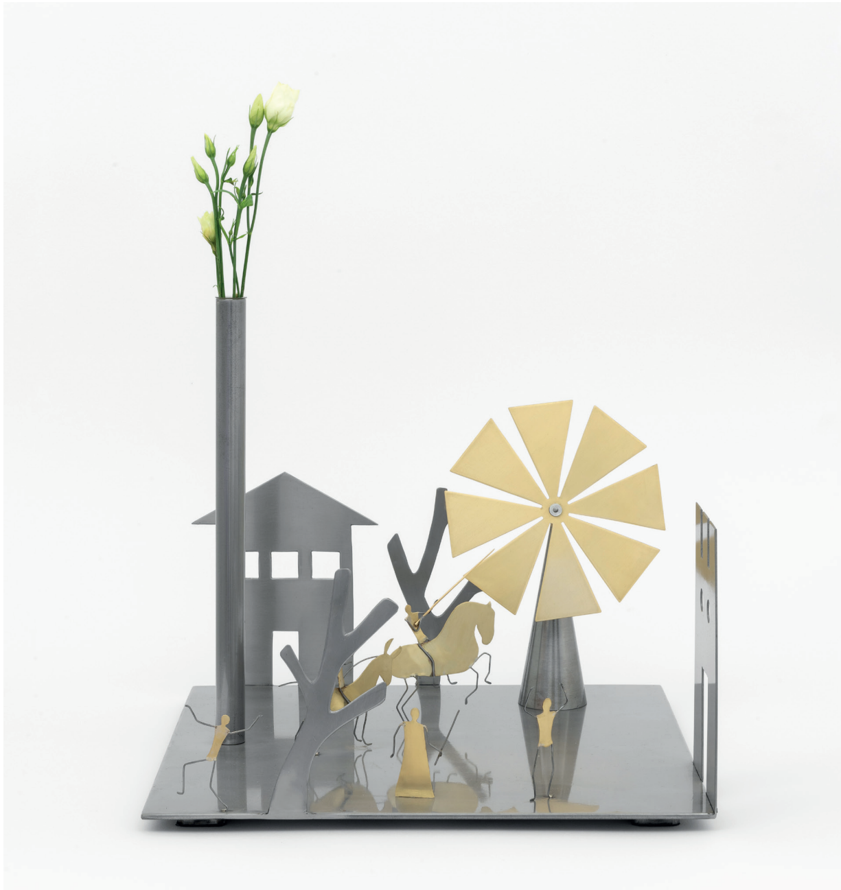
Piazzes n. 4 , 2023 alluminio rame aluminium, copper 32 x 35 x 35 cm