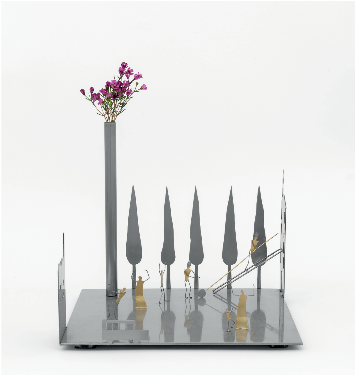
Piazze n. 6 , 2023 alluminio rame aluminium, copper 31 x 35 x 35 cm