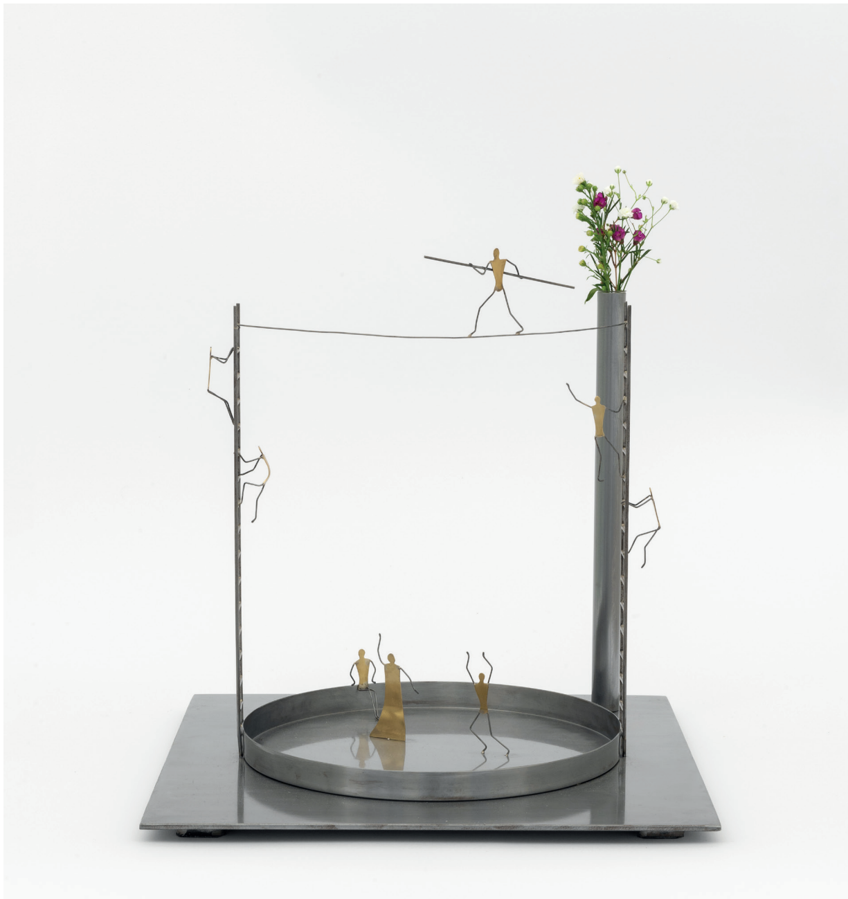
Piazzette n. 7 , 2023 alluminio, rame aluminium, copper 36 x 35 x 35 cm