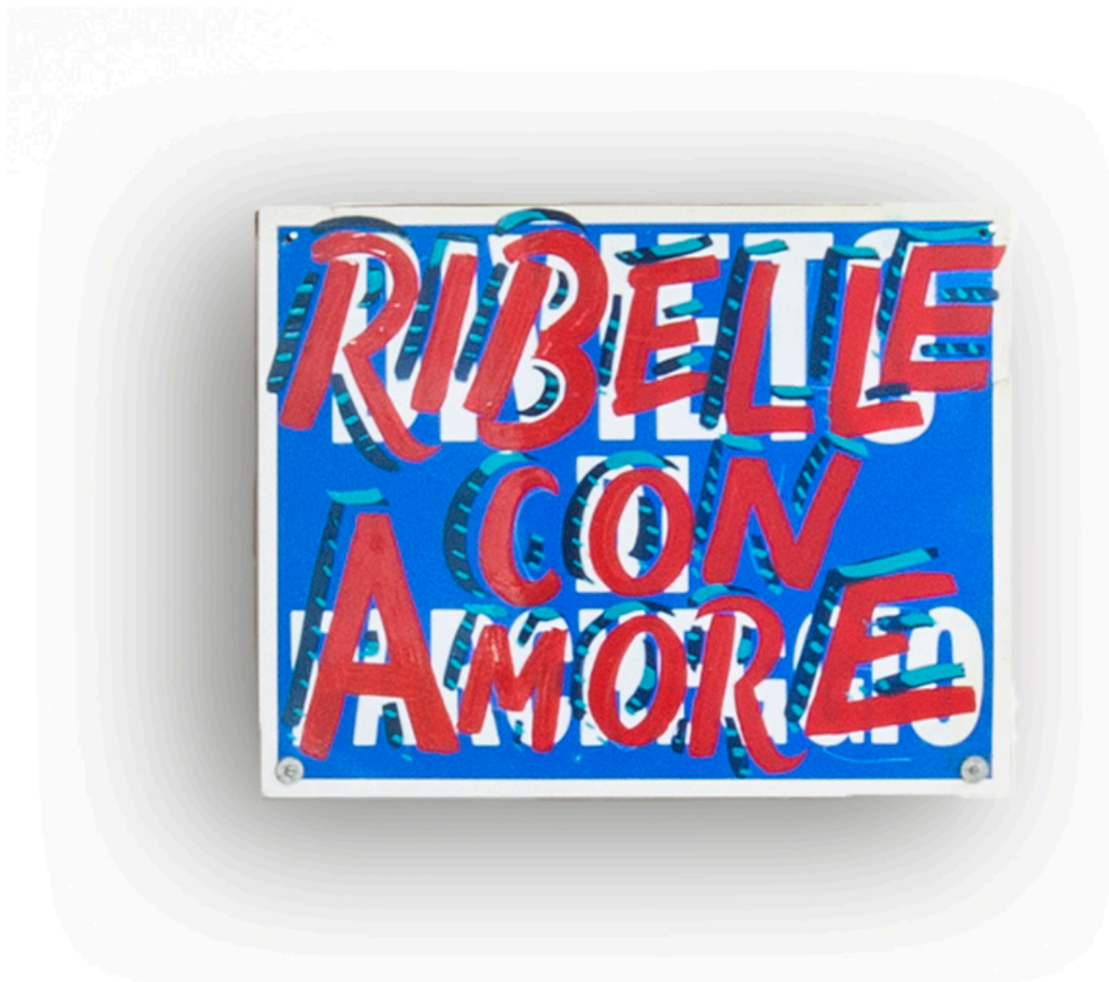
Ribelle con amore , 2023