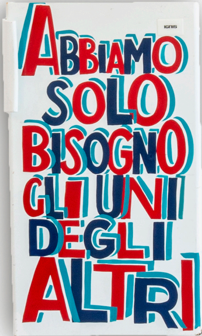
Abbiamo solo bisogno gli uni degli altri, 2023

vernice su porta di frigorifero paint on refrigerator door 80 x 45 cm (31,50 x 17,72 in)