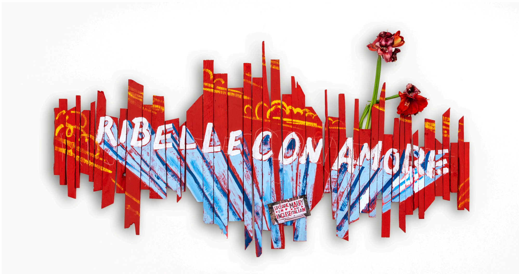
Ribelle con amore , 2023