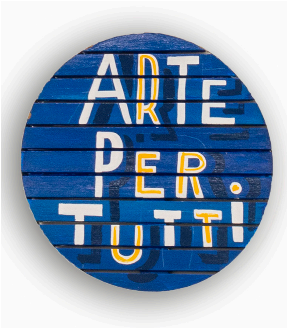
Arte per tutti , 2023 vernice su legno paint on wood ø 60 cm (ø 23,62 in)