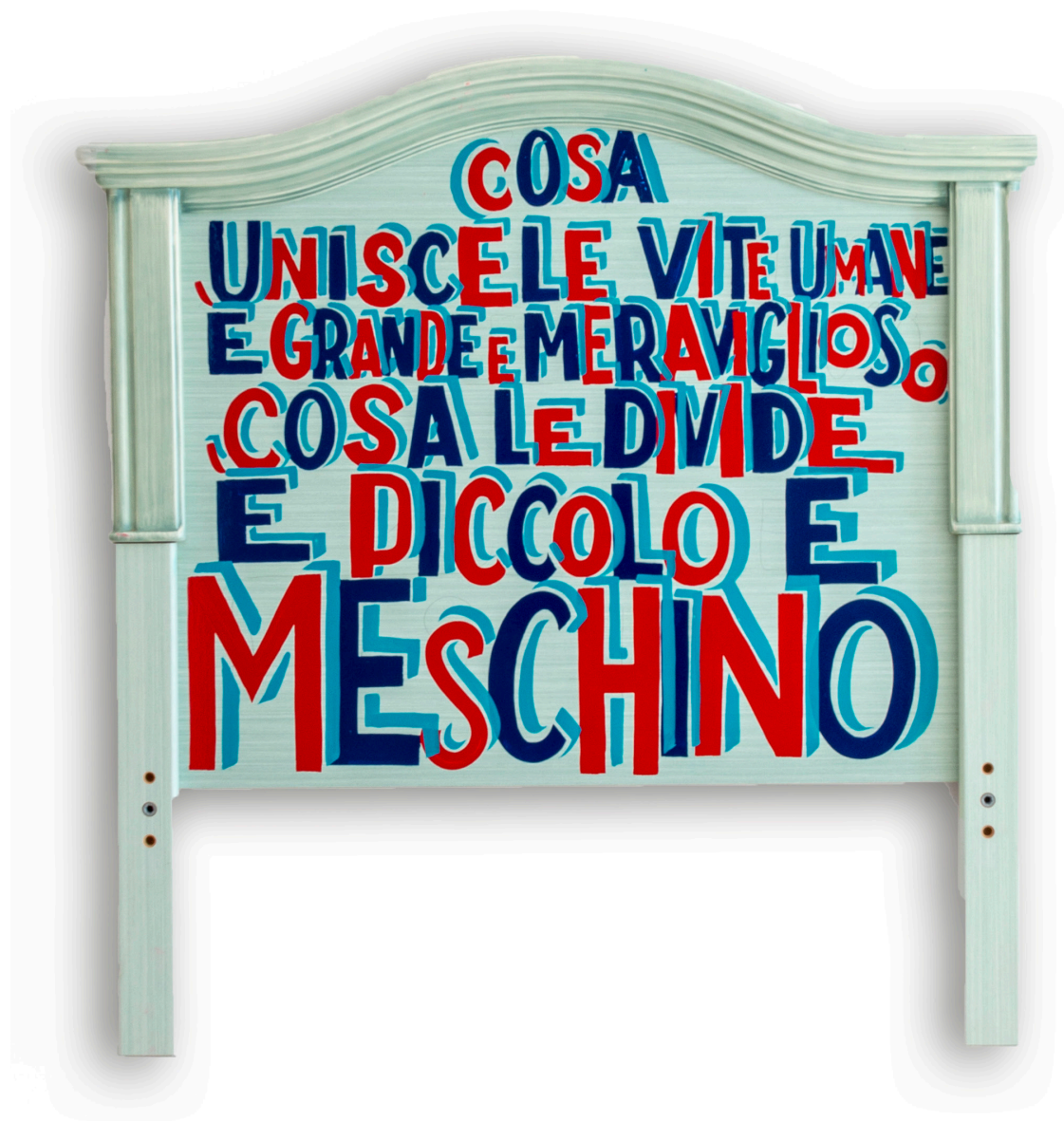
Cosa unisce le vite umane è grande e meraviglioso, cosa le divide è piccolo e meschino, 2023